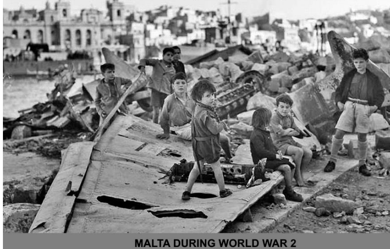
MALTA DURING WORLD WAR 2

Life on Malta during this period posed some hardships, including a lack of food, the blackout and the continual threat of invasion. Children pictured among the Stuka wreckage in 1941