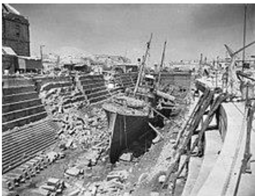
a bomb-damaged Dry Dock No 3 during World War II

The Royal Navy Dockyard was initially located around Dockyard Creek, and occupied several of the dockyard buildings formerly used by the Knights of Malta. By 1850 the facilities included storehouses, a ropery, a small steam factory, victualling facilities, houses for the officers of the Yard, and most notably a dry dock – the first to be provided for a Royal Dockyard outside Britain. [2] Begun in 1844, the dry dock was opened in 1847; ten years later it was extended to form a double dock (No. 1 and No. 2 dock). [1] Allegedly, marble blocks from the Mausoleum at Halicarnassus, one of the Seven Wonders of the Ancient World, were used for the construction of these docks.