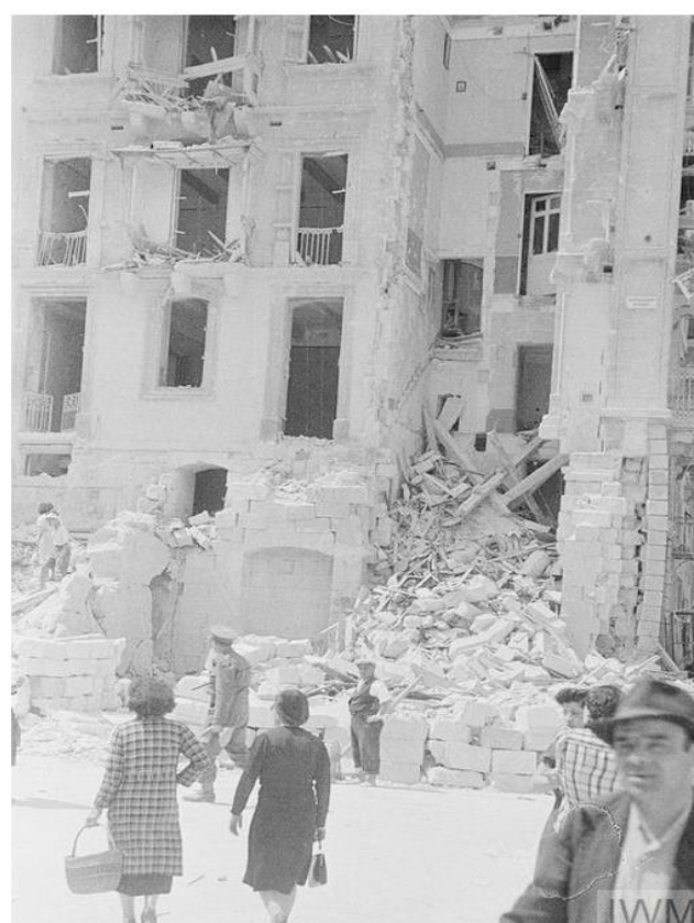
BOMB DAMAGE FROM THE RENEWED BLITZ ON MALTA. MAY 1942, MALTA.

World War 2 - Malta most bombed country in the world