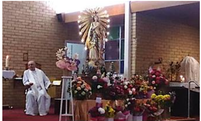
The statue of "IL-BAMBINA" at Lockleys Church

The weather was lovely and the street lit up and adorned with the beautiful ‘Pavaljuni’ brought back memories of our ‘Purcissjoni’ back home in Malta.