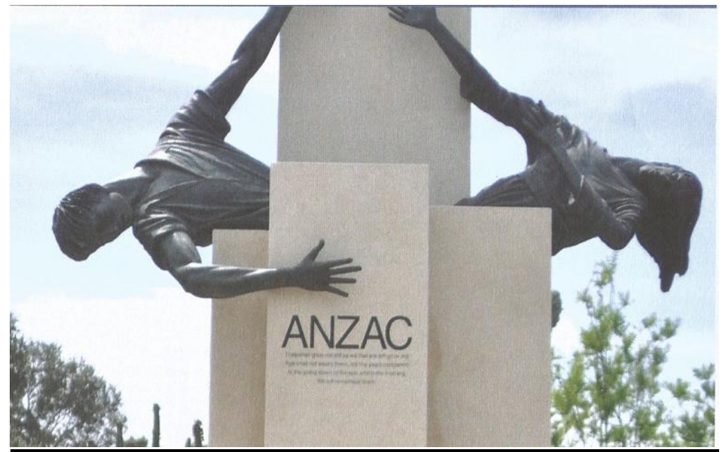
The beautiful ANZAC Memorial at the Argotti Botantical Gardens, Floriana, Malta