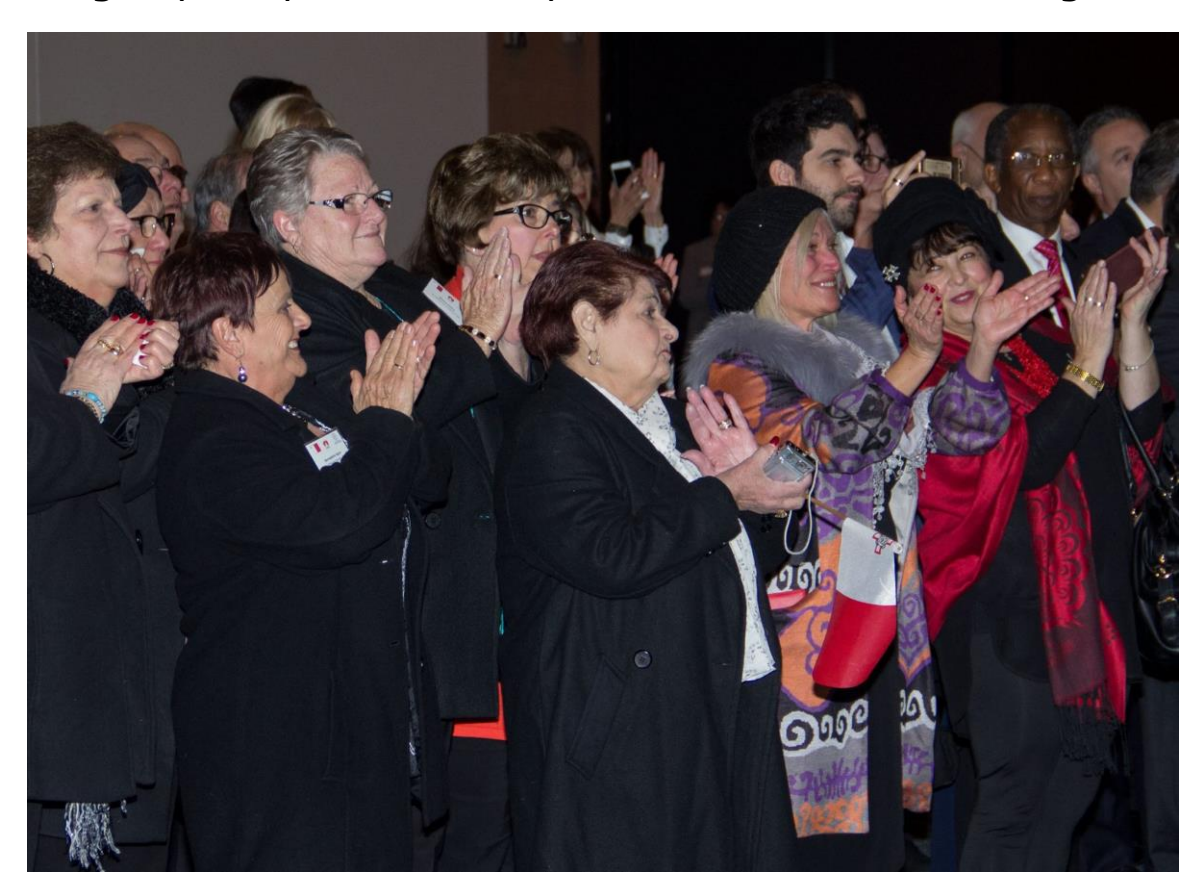
Part of the audience at