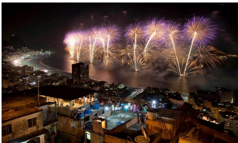
New Years Eve in Malta

The southern European nation of Malta, which is officially referred as The Republic of Malta, celebrates its New Year on the date of January 1, following the Georgian calendar system.