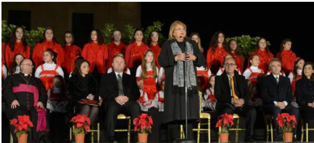
President Marie-Louise Coleiro