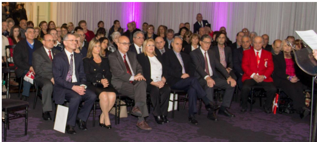
The President meeting the Maltese Community of Victoria

fuq SBS Radio għal intervista li ser tixxandar dalwaqt fuq l-istess stazzjon. Waqt l-intervista hadt l-opportunita' li niringrazzja lill-komunitajiet Maltin fl-Awstralja għall-laqgħa mill-isbaħ li nghatajt. Sellimt ukoll lil numru ta' Maltin u Għawdxin li ma' setghux jigu għad-diversi laqgħat li kelli.