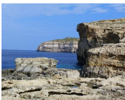
The Azure Window before and after it collapsed in March 2017.

But all is not lost because when one window closes another opens, and our knowledgeable guides knew just where to take us to see what is hoped will be the replacement. The new site is currently underdeveloped,