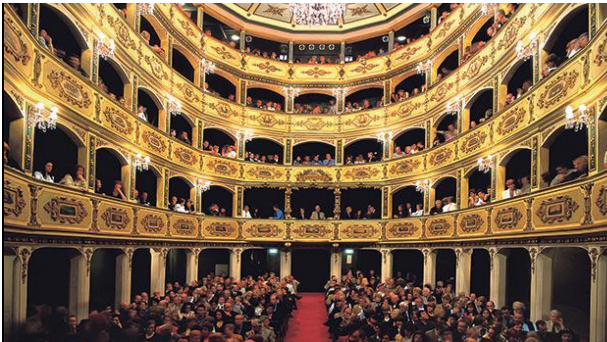
The program begins at the Manoel Theatre, Valletta, on January 13 with Vivaldi's The Four Seasons .