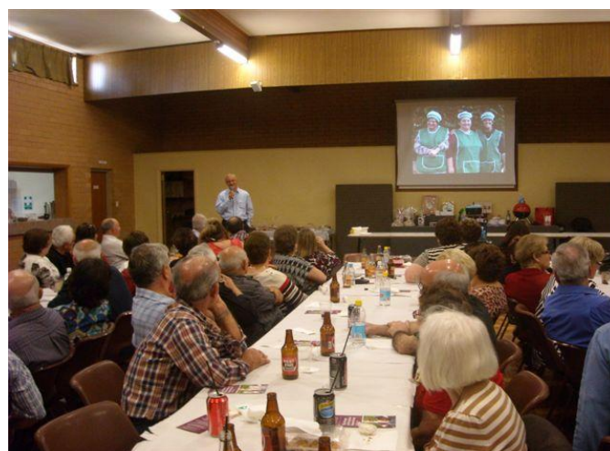
Part of the large crowd who attended the function