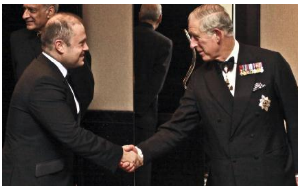
Prime Minister Joseph Muscat with Prince Charles.

Unanimous agreement for Malta to host the Commonwealth Heads of Government Meeting in 2015.