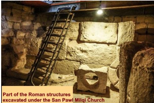
Part of the Roman structures excavated under the San Pawl Milqi Church

archaeological evidence in support of Christian claims, and it is considered a myth dating to the middle ages. In fact, evidence of Christian worship on the site only dates back to the building of the first chapel in the fourteenth century. The site was included on the Antiquities List of 1925.