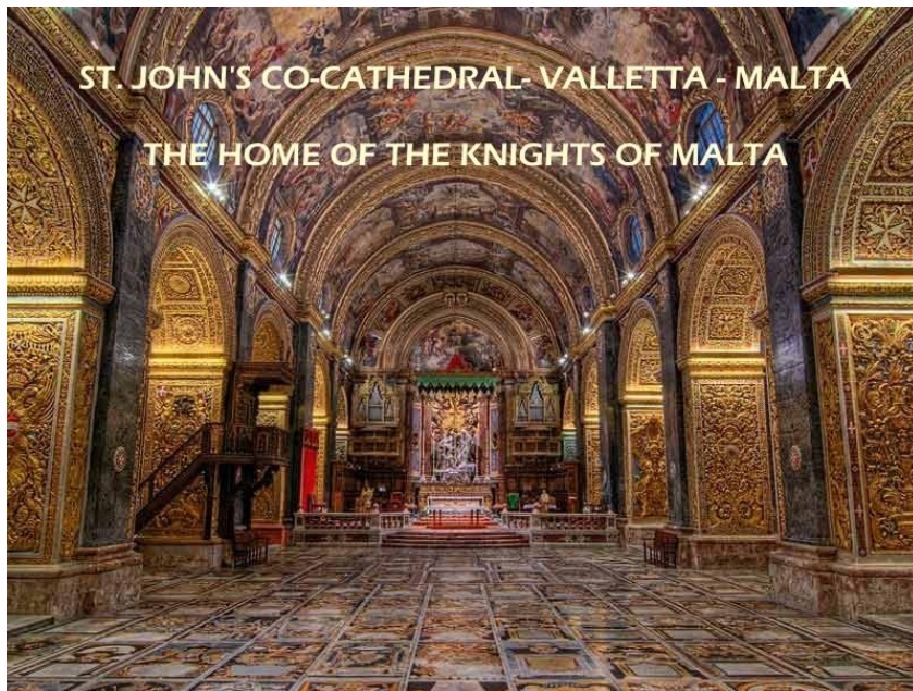
ST. JOHN'S CO-CATHEDRAL - VALLETTA - MALTA