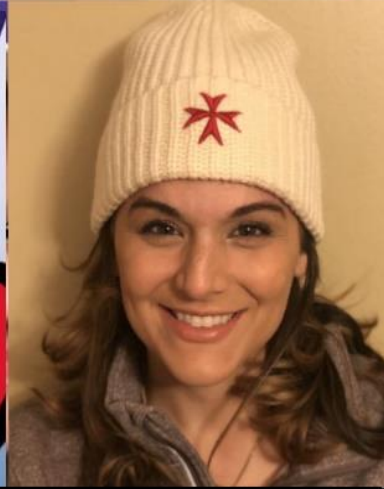
Maltese-Americans in USA