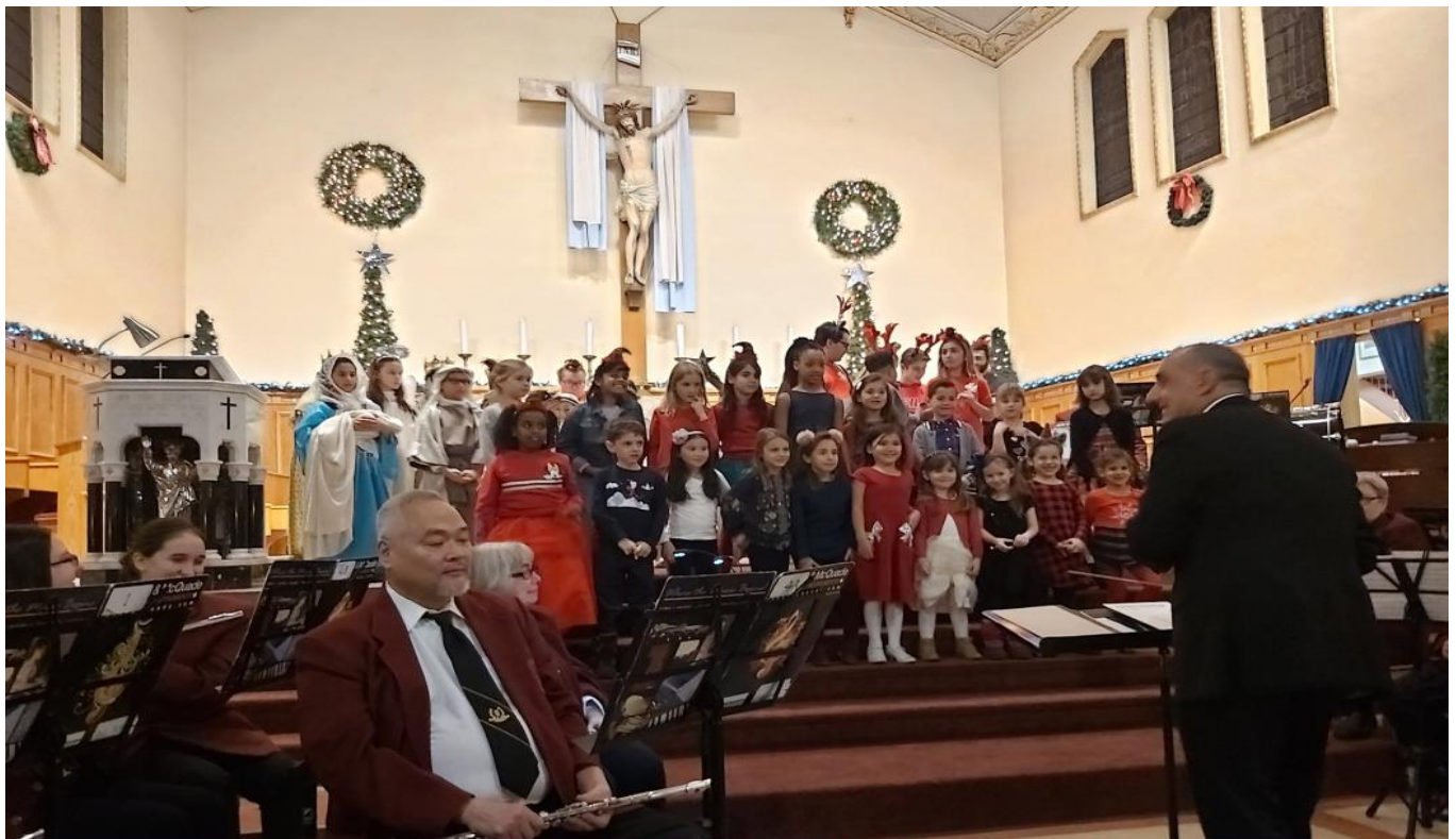
MALTESE-CANADIAN COMMUNITY NEWS St Paul The Apostle Christmas Concert The grand finale 'Holiday Sing Along' performed by the Malta Band, the St. Cecilia's Choir and all those who participated in the concert. An awesome end to such a great event. By far the most popular Maltese Christmas carol and the most anticipated at the St Paul The Apostle Christmas Concert is 'Ninni, La Tikkix Izjed'