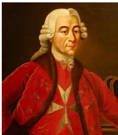
Grand Master Emmanuel De Rohan