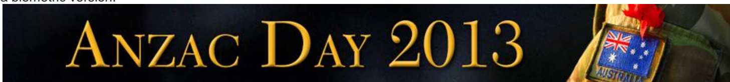
Anzac Day 2013

Since 2008, the Passport Office has issued biometric passports in Malta, according to international standards and directives. These documents contain facial imagery, signature and fingerprint biometrics held in a secure manner – in a chip embedded in the passport. If you are applying for a new passport or updating an old one, you will now be issued with a biometric version.