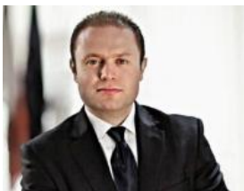
Dr. Joseph Muscat Prime Minister of Malta - 2013

With effect from 2004, all Maltese living abroad who acquired their Maltese citizenship also acquired a European citizenship. Therefore, notwithstanding the fact that we are not living in Malta we enjoy the same rights as all EU citizens living within the EU.