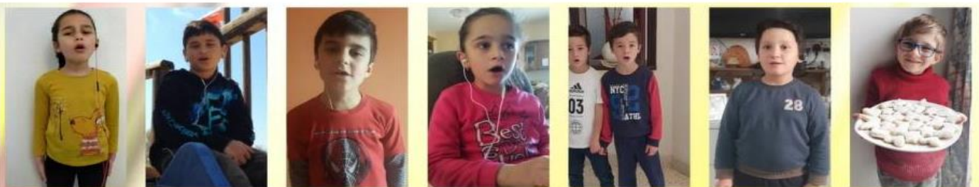
Primay School - Dingli, Malta