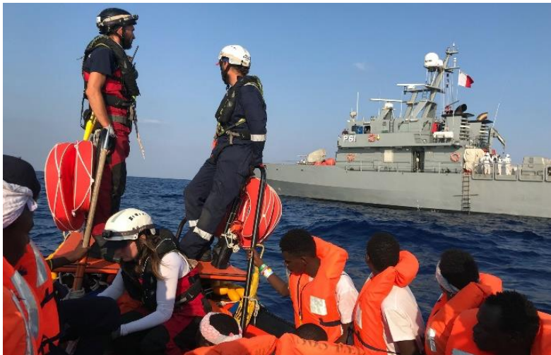
Migrants being transported to a Maltese Navy ship last year.