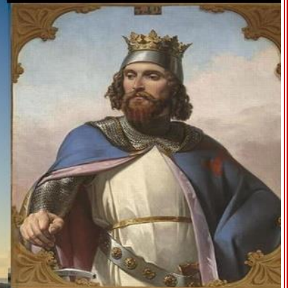
THE GREAT COUNT Roger I of Sicily Conquest of Malta