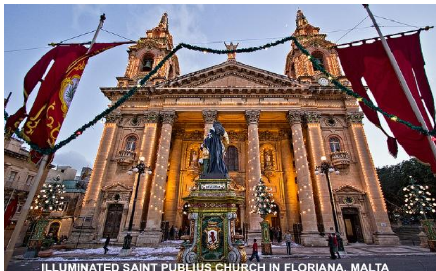
ILLUMINATED SAINT PUBLIUS CHURCH IN FLORIANA, MALTA