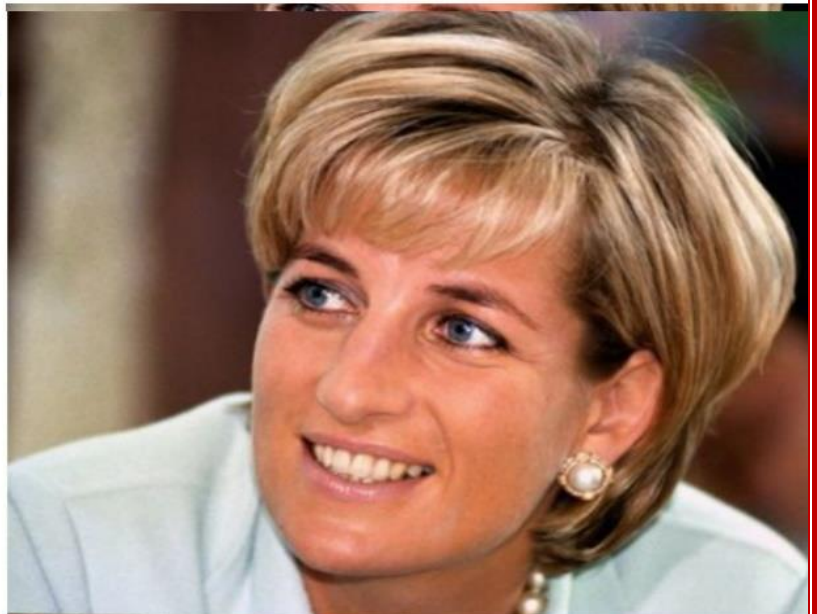
Princess Diana statue to be installed to mark her 60th birthday