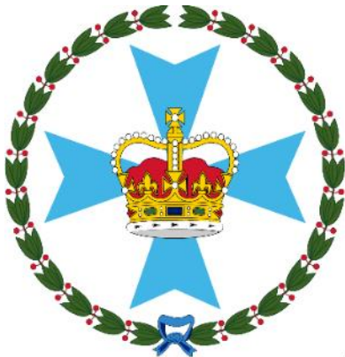
Why is the Maltese Cross included in Queensland's Coat of Arms?

The inclusion of the Maltese Cross in the Queensland Badge and Coat of Arms has an interesting and somewhat inconclusive history.