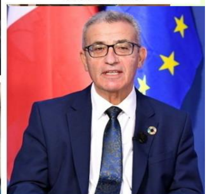
Hon Evarist Bartolo MP We serve our country Ministry for Foreign and European Affairs