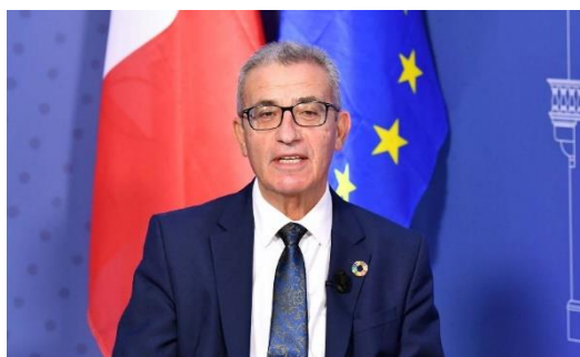
Hon Evarist Bartolo - Minister