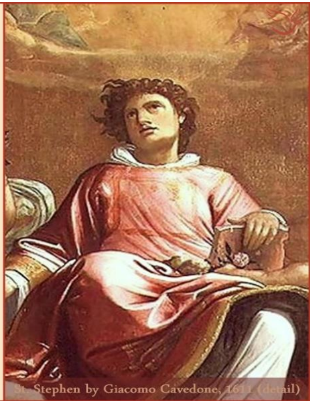
St. Stephen by Giacomo Cavedone, 1611 (detail)

The Guild of St. Stephen traditionally award their crosses, medals and awards to altar servers on this day.