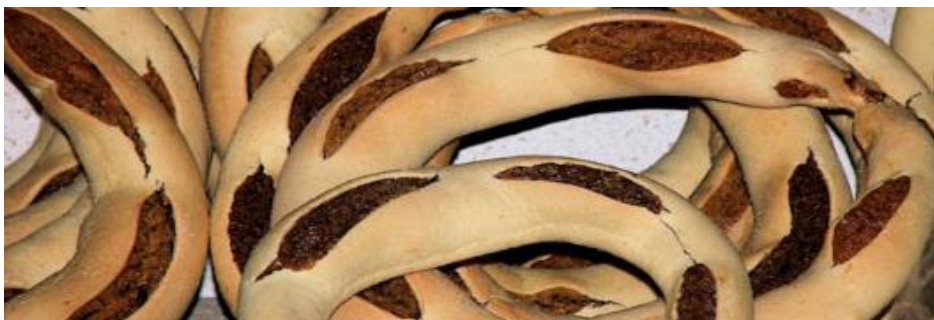
Maltese Christmas Treat QAGHAQ TAL-GHASEL HONEY RINGS

Sunday 3 rd January, at 9:30 a.m., the Archbishop concludes the Christmas festivities as he celebrates the Epiphany of the Lord at St John's Co-Cathedral in Valletta. During mass the Archbishop will confer the Ministry of Acolytes on two seminarians and the Ministry of Lector on three others. The celebration will also be broadcast on TVM2 .