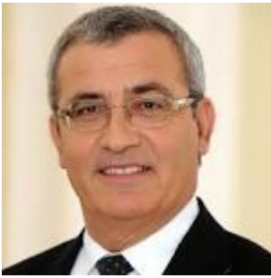
Message tal-Milied u l-aħħar tas-Sena 2021 Mill-Onor. Evarist Bartolo Ministru għall-Affarijiet Barranin u Ewropej Lill-Maltin li jgħixu barra minn Malta

Għeziež ħuti, Xtaqt żortkom fix-xhur li għaddew imma ma stajtx minħabba l-Covid-19. Nittama li fix-xhur li għejjin inkun nista' nivvjagga u nigi narakom. Bħal ħafna eluf oħra li ngħixu fil-gzejjer Maltin għandi qrabati f'pajjizi differenti, u allura meta nżur pajjizi oħra fejn jgħixu Maltin u Għawdxin ma nħossnix qed inżur pajjiz barrani. Inkun qed inżur lil tal-familja, mhux biss dawk li jigu minni, iżda tal-familja Maltija. Il-familja Maltija hija ferm ikbar minn kemm għandna jgħixu fil-gzejjer tagħna. Għandna Maltin u Għawdxin jgħixu f'pajjizi oħra f'kull naħa tad-dinja, kważi daqskemm għandna jgħixu fil-gzejjer tagħna. Tajjeb li nżommu ħajjin irrabtiet ta' bejnietna u nsaħħuhom. Aħna fejn aħna nistgħu nħobbu lill-pajjiżna u lill-poplu tagħna waqt li nkunu parti sħiħa u ħajja mis-soċjeta' fejn qegħdin. F'dinja fejn tant żdied it-taħlit ta' popli, razzi, nazzjonalitajiet, ilsna u kulturi differenti, aktar hemm ċans jizdiedu l-kunflitti bejnietna. Imma aktar ukoll hemm iċ-ċans li jekk nagħmlu sforz ġenwin u diffiċli kemm hu diffiċli nitgħallmu ngħixu flimkien u nirrispettaw lil xulxin aktar hemm ċans li nagħrfu li aħna aħwa lkoll tal-familja umana li tgħix f'din il-pjaneta u ħafna mill-isfidi kbar li għandna quddiemna nistgħu negħelbuhom biss, mhux billi niġgieldu w inkunu għedewwa ta' xulxin iżda billi naħdmu flimkien għall-ġid komuni. Awguri 2021