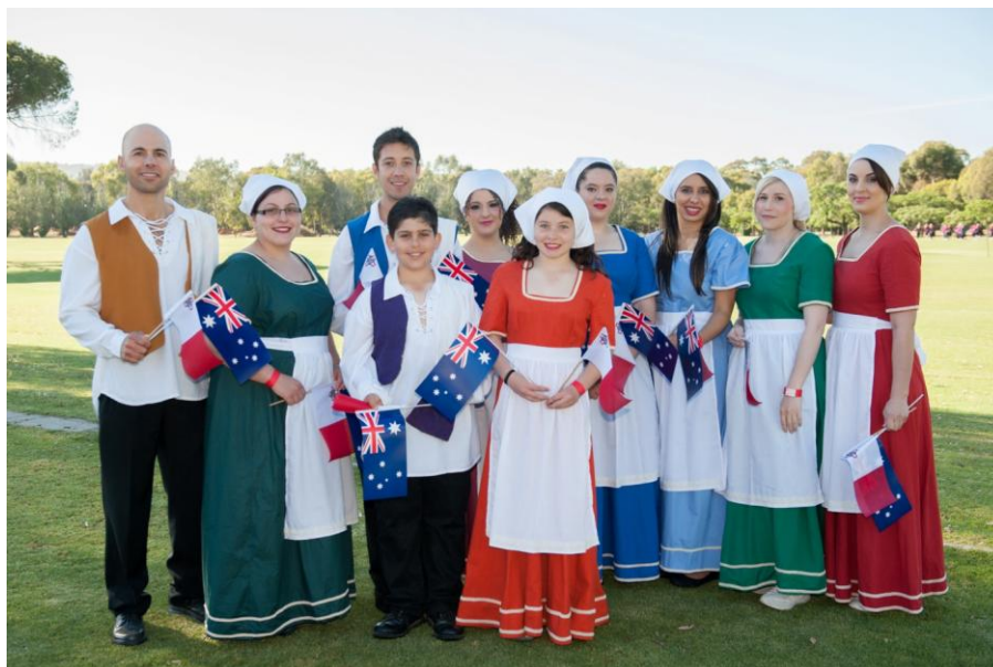
A GROUP AUSTRALIAN/MALTESE YOUNGSTERS DRESSED IN MALTESE NATIONAL COSTUME PARTICIPATING IN ONE OF THE EVENTS IN THE CITY OF ADELAIDE