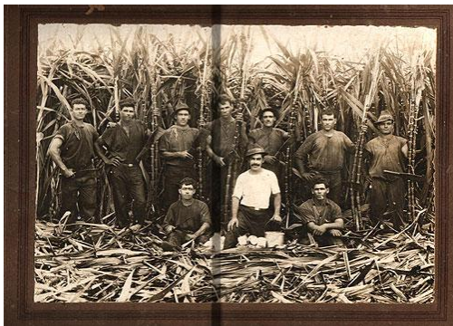
MALTESE CAN CUTTERS IN MACKAY, QUEENSLAND

The Skaubryn left Malta on the last day of March 1958, having embarked 169 men, women and children at Valletta. About 3 days out of Aden, in the Indian Ocean, fire swept the decks from the direction of the engine room and soon the vessel was engulfed in flames. Passengers were assisted to lifeboats, the ship was abandoned and soon sank. Some passengers were rescued by the 'CITY OF SYDNEY', a tanker and a tug. They returned to Aden, the passengers completed their journey to Australia in "Roma" and "Orsova!". No one lost their life in direct consequence of the fire.