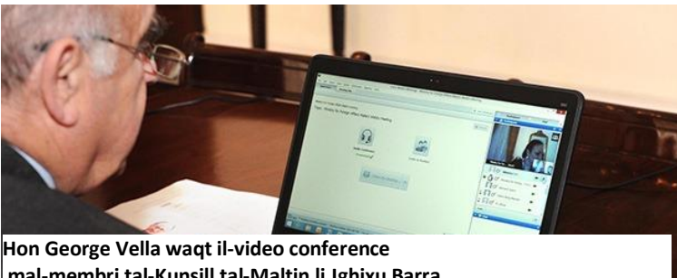
Hon George Vella waqt il-video conference mal-membri tal-Kunsill tal-Maltin li jgħixu barra

Jekk mingħalik li l-Maltin li jgħixu barra minn Malta jinsabu biss f'pajjiżi bħall-Awstralja, l-Ingilterra, l-Amerka u l-Kanada, sejjer imqarraq. Għax il-Maltin issibhom imxerrdin letteralment mal-erbat irjieħ tad-dinja – saħansitra f'pajjiżi li rari nisimgħu bihom, bħal Benin, Bhutan, Burma, Guam, Vanuatu, Tuvalu u Samoa. Fi kliem ieħor, lill-Maltin issibhom kullimkien.