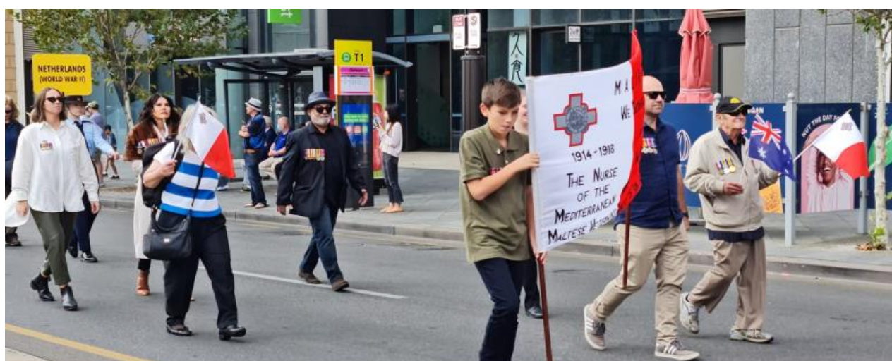
A small contingent of Maltese marching in the streets of Adelaide- Australia for ANZAC DAY 25 April 2022