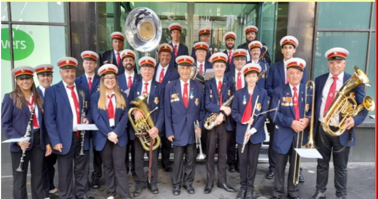
The Maltese Concert Band of NSW participated in the ANZAC parade 2022 in Sydney. Thank you to everyone for honouring those who died in all wars and our service persons who continue to protect our country.