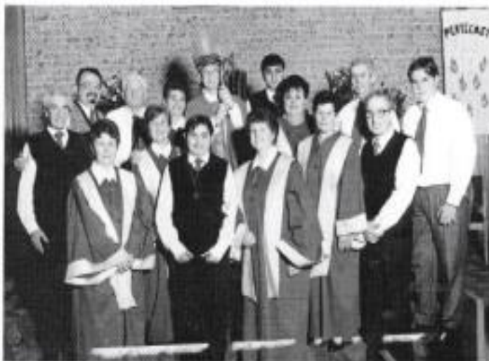
La Valette Choir 1999