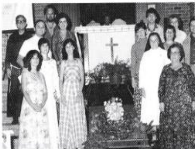
The first La Valette Choir NSW