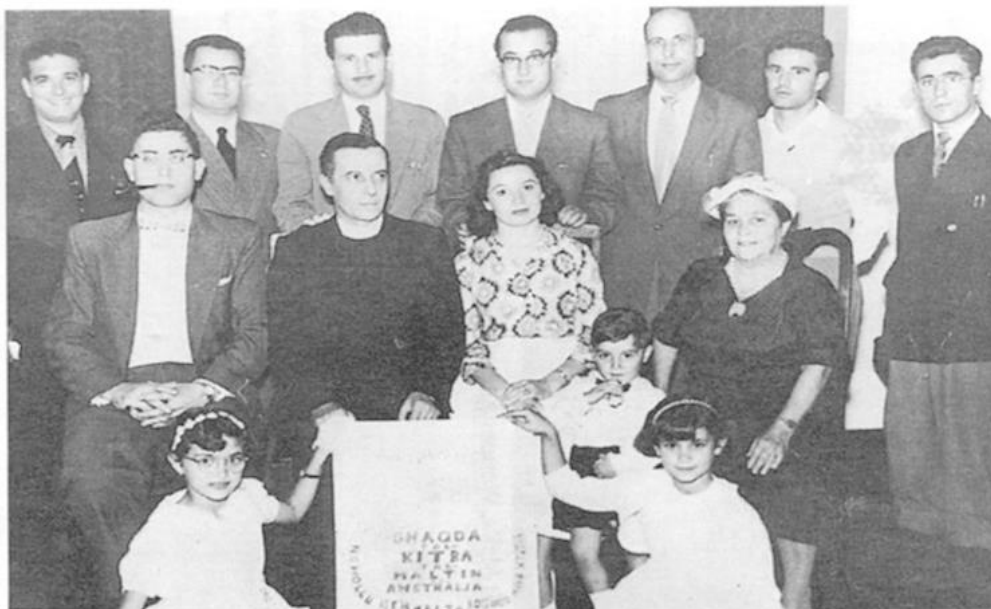
GHAQDA TAL-KITTIEBA MALTIN - MELBOURNE -AWSTRALJA 1953