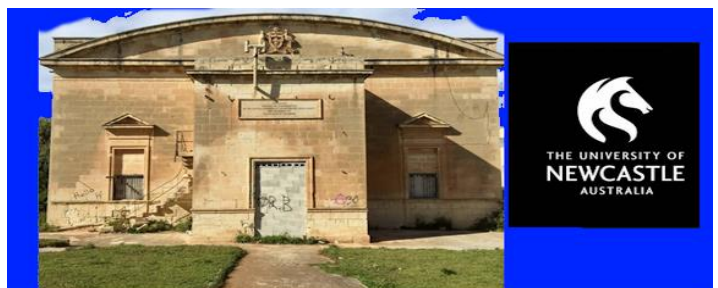
Australia Hall in Malta. Erected in 1916 to entertain sick and wounded Anzacs from the Gallipoli campaign.

Was your Anzac ancestor evacuated to Malta from Gallipoli in 1915? Or, did your ancestor work at a hospital in Malta treating Anzacs?