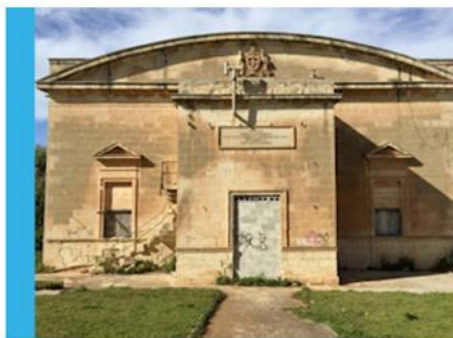
Australia Hall in Malta. Erected in 1916 to entertain sick and wounded Anzacs from the Gallipoli campaign.