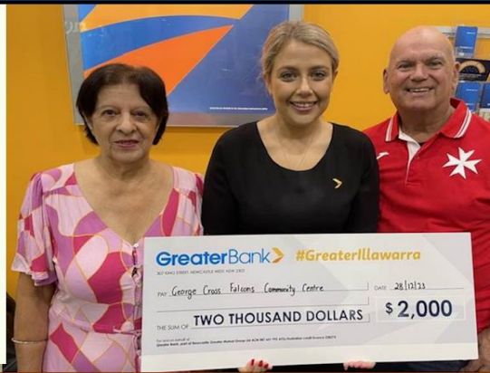
GEORGE CROSS FALCONS COMMUNITY CENTRE - CRINGILA - NSW