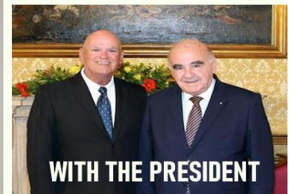
WITH THE PRESIDENT