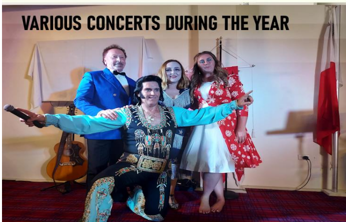
VARIOUS CONCERTS DURING THE YEAR