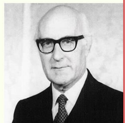
SIR ANTHONY MAMO The First President of Malta