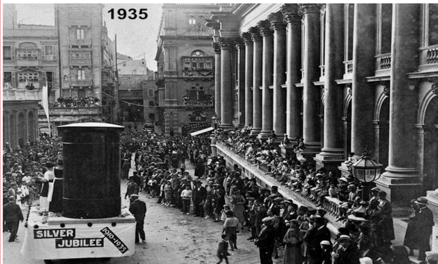
The Malta Royal Opera House - Pity - it was never rebuilt