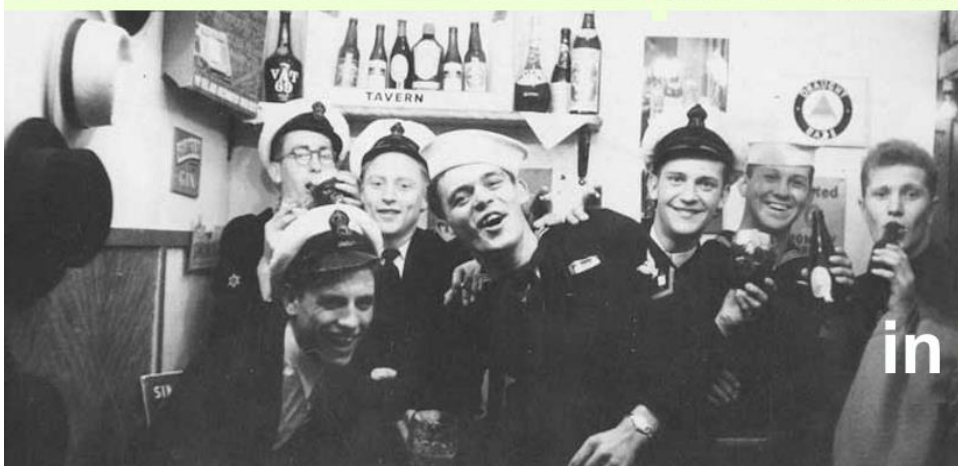
"The Gut" Strait Street in Valletta Malta STRADA STRETTA in the 50s to 70s