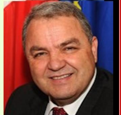
Hon Anglu Farrugia SPEAKER