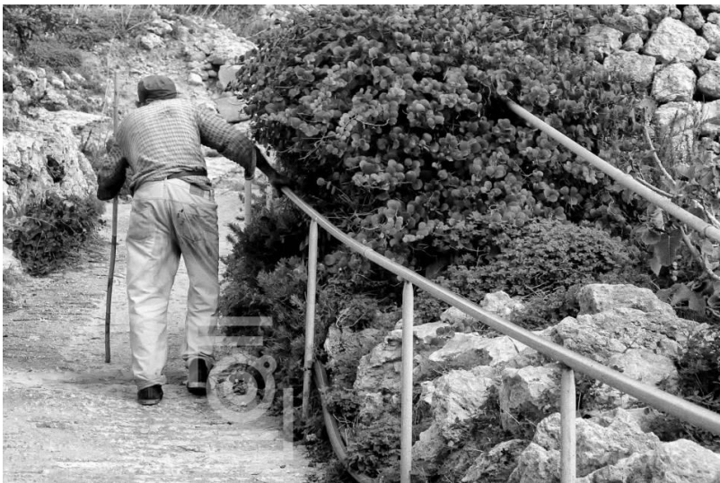
An old Gozitan farmer walking his way from his fields in Xaghra.