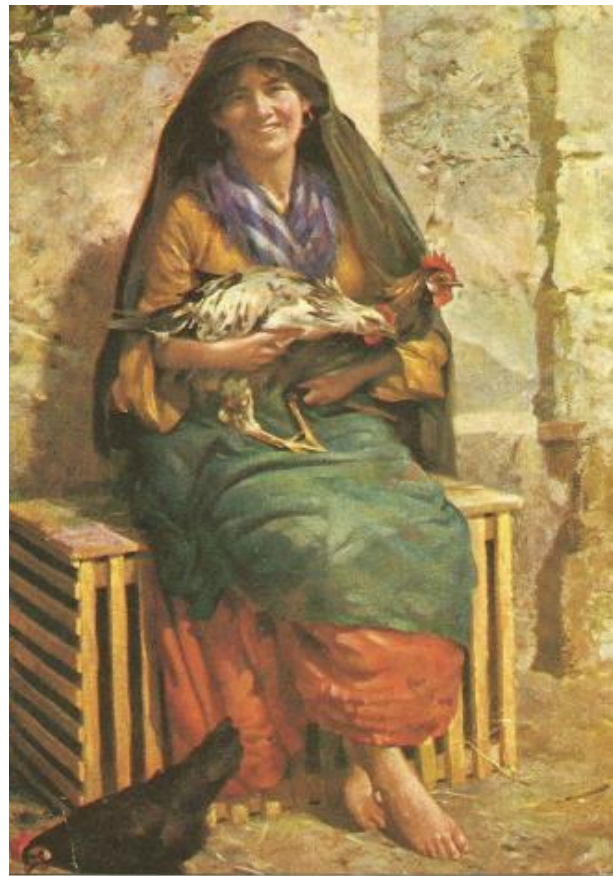
THE CHICKEN HAWKER