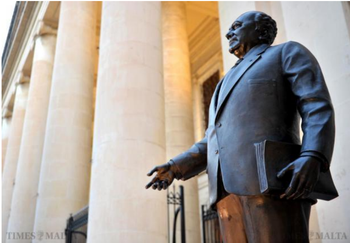
The statue of the ex- President Guido de Marco, lawyer and politician, born 22 July 1931; died 12 August 2010

"We wanted to portray Prof. de Marco as a people's person. The first thing he did when he met somebody was shake his/her hand.