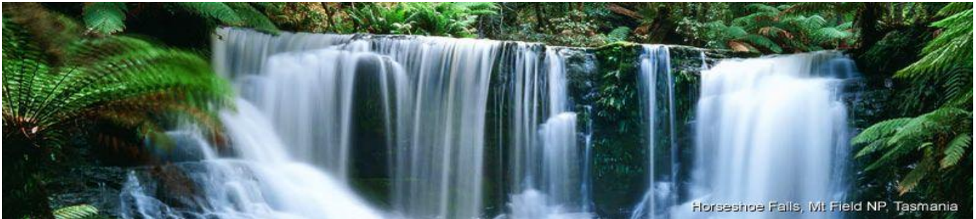
Horseshoe Falls, Mt Field NP, Tasmania

Separated from the mainland of Australia by the notorious waters of Bass Strait, Tasmania is an island of unspoilt natural beauty and wild landscapes, renowned for its outstanding food and wine, and provides an idyllic destination for the acclaimed Sydney to Hobart yacht race. Close to a fifth of the island is protected National Park, a refuge for rare and endangered plants and animals, boasting ancient forests, rugged coastlines and glittering waters.