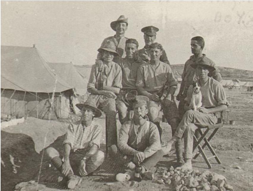
Island haven ... Recovering ANZAC soldiers in Malta during WW1.

Building inspectors reckon the sandstone block walls and portals are sound and now even the original blueprints have been found for the building and 6000sqm grounds. But restoration is likely to be in the millions of dollars.