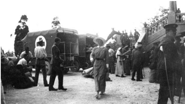
arriving in Malta from Gallipoli 1915

The heavy losses prompted the Allies to cease any further attempts to take the straits by naval power alone. WWI was marked by large forces engaged in static trench warfare that sustained many casualties. Gallipoli was no exception. About 480,000 allied troops took part in the campaign.