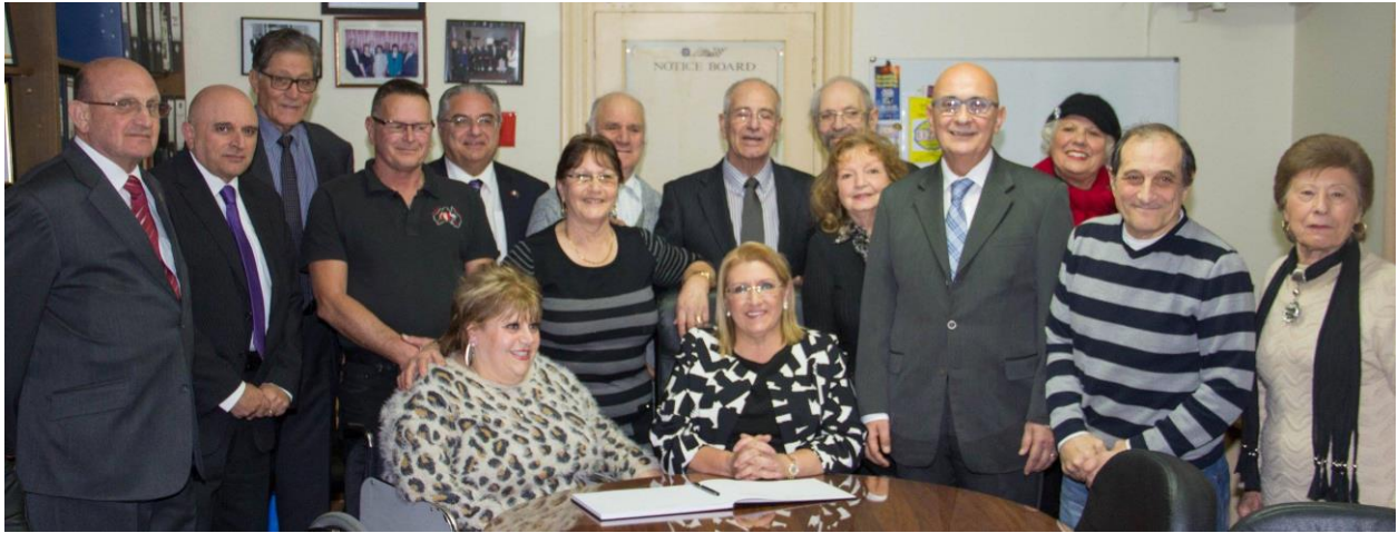
The President with the Committee of the Maltese Guild of SA