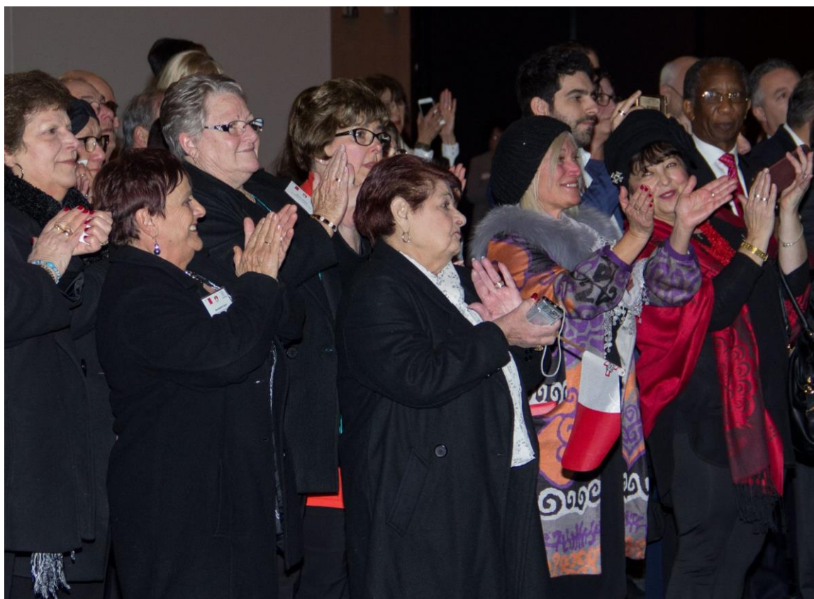
Part of the audience at