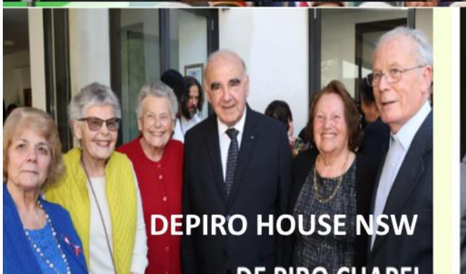
DEPIRO HOUSE NSW