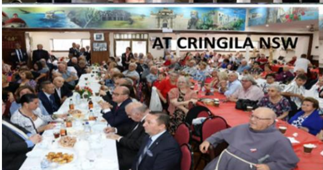
AT CRINGILA NSW