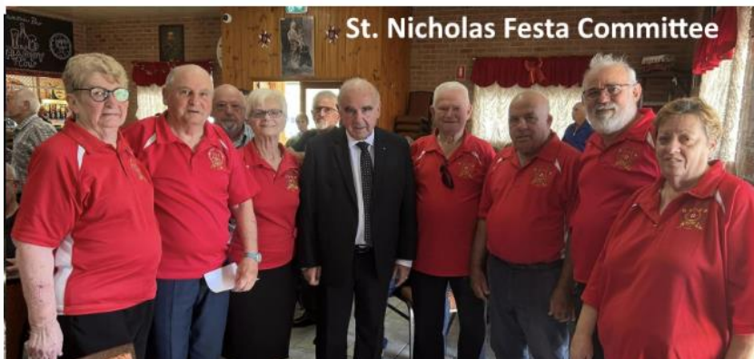
St. Nicholas Festa Committee