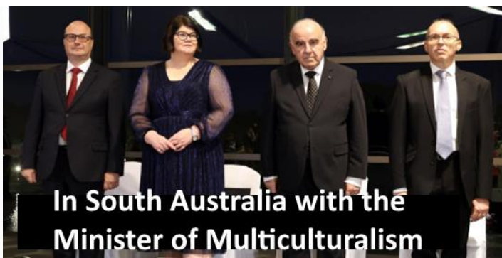
In South Australia with the Minister of Multiculturalism