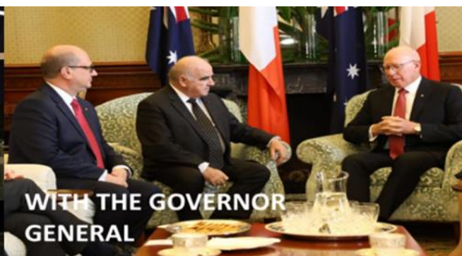
WITH THE GOVERNOR GENERAL