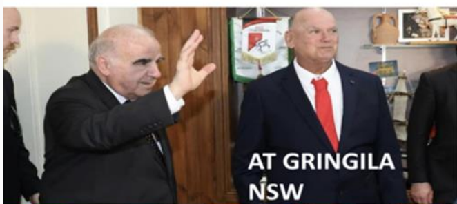
AT GRINGILA NSW