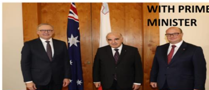
WITH PRIME MINISTER